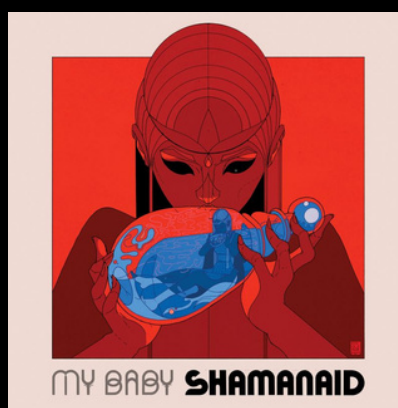
Shamanaid | 2013