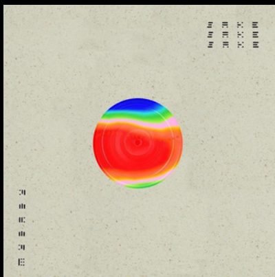
Sake Sake Sake | 2022