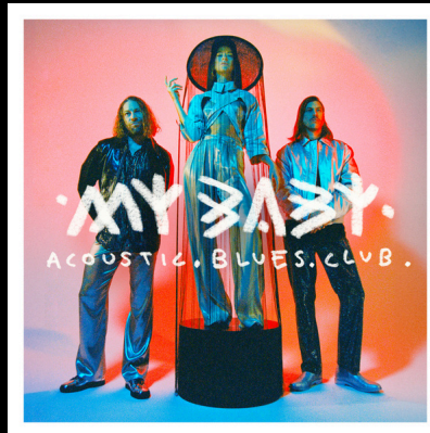
Acoustic.Blues.Club. | 2024