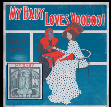
My Baby Loves Voodoo! | 2013