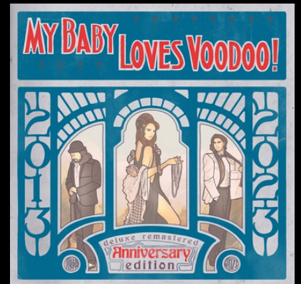
My Baby Loves Voodoo 10 year anniversary edition | 2023