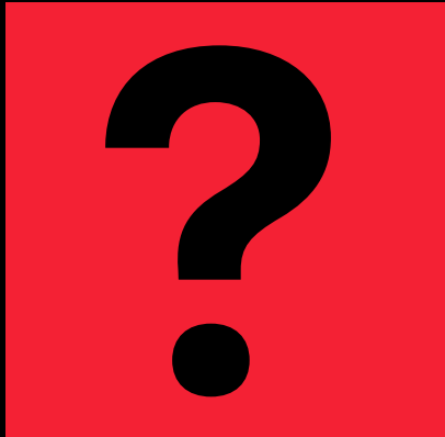
NEW ALBUM COMING 2025