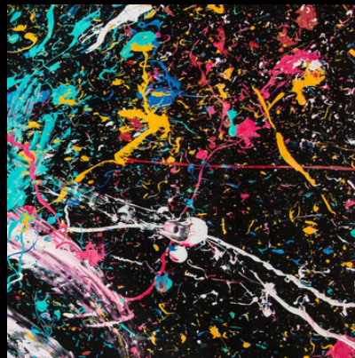
Live! | 2019