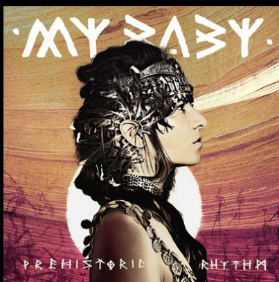
Prehistoric Rhythm | 2017